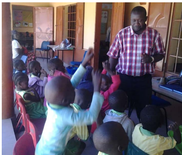
Teaching at Sgoil Creideamh